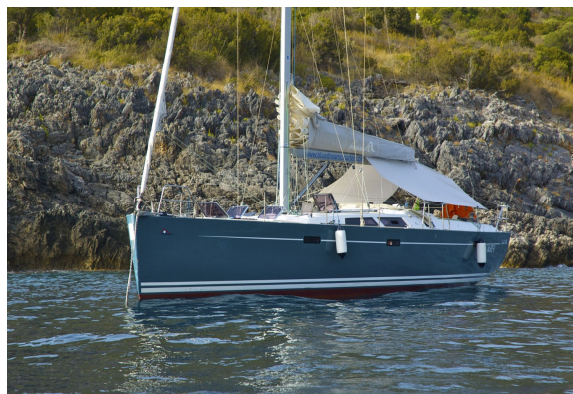
Real picture of the boat